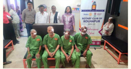
4 beneficiaries for cataract surgeries