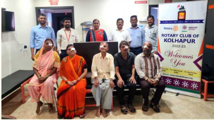
5 beneficiaries for cataract surgeries.